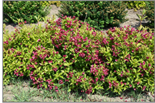
Ghost Weigela in bloom

This shrub should only be grown in full sunlight. It prefers to grow in average to moist conditions, and shouldn't be allowed to dry out. It is not particular as to soil type or pH. It is highly tolerant of urban pollution and will even thrive in inner city environments. This is a selected variety of a species not originally from North America.