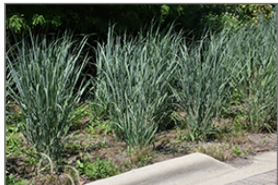
Dallas Blues Switch Grass