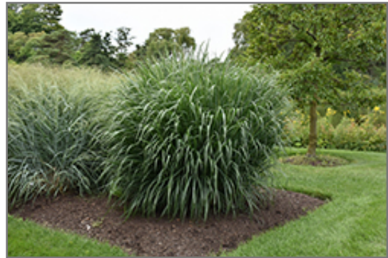
Dallas Blues Switch Grass