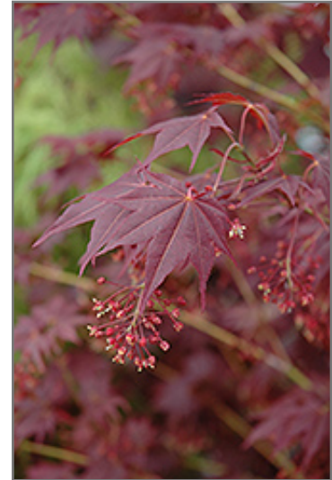
Tsukushigata Red Japanese Maple flowers

Tsukushigata Red Japanese Maple will grow to be about 15 feet tall at maturity, with a spread of 10 feet. It tends to be a little leggy, with a typical clearance of 2 feet from the ground, and is suitable for planting under power lines. It grows at a slow rate, and under ideal conditions can be expected to live for 50 years or more.