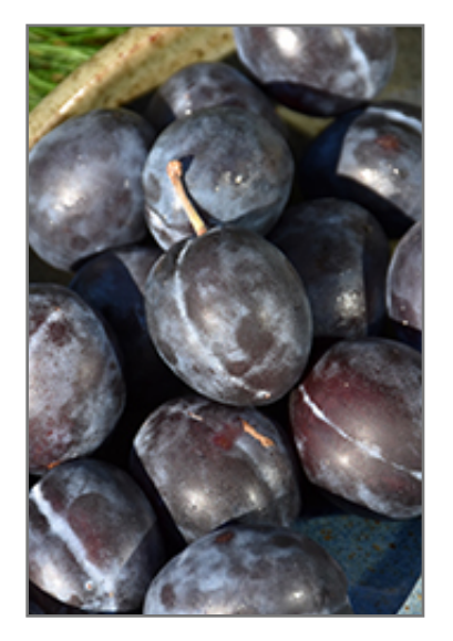
Stanley Plum fruit