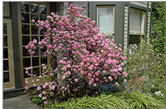
Olga Mezitt Rhododendron in bloom