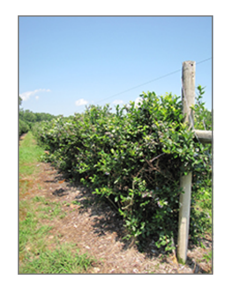
Patriot Blueberry fruit