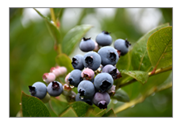
Patriot Blueberry fruit