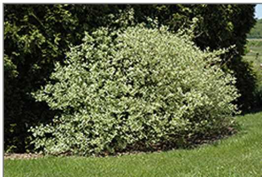
Silver and Gold Dogwood