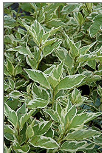
Silver and Gold Dogwood foliage

Silver and Gold Dogwood is recommended for the following landscape applications;