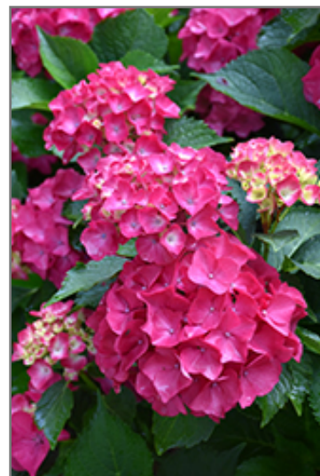
Cityline Paris Hydrangea flowers

Cityline Paris Hydrangea is recommended for the following landscape applications;