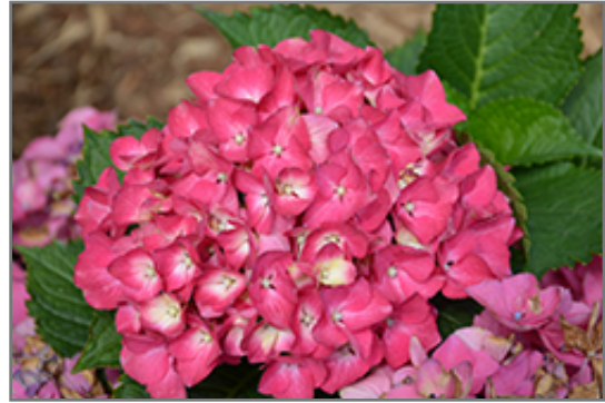
Cityline Paris Hydrangea flowers

Cityline Paris Hydrangea makes a fine choice for the outdoor landscape, but it is also well-suited for use in outdoor pots and containers. Because of its height, it is often used as a 'thriller' in the 'spiller-thriller-filler' container combination; plant it near the center of the pot, surrounded by smaller plants and those that spill over the edges. It is even sizeable enough that it can be grown alone in a suitable container. Note that when grown in a container, it may not perform exactly as indicated on the tag - this is to be expected. Also note that when growing plants in outdoor containers and baskets, they may require more frequent waterings than they would in the yard or garden.