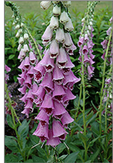
Sugar Plum Foxglove flowers