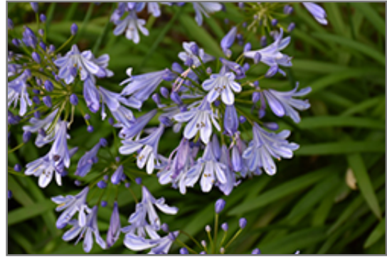
Queen Anne Agapanthus flowers

Queen Anne Agapanthus is recommended for the following landscape applications;