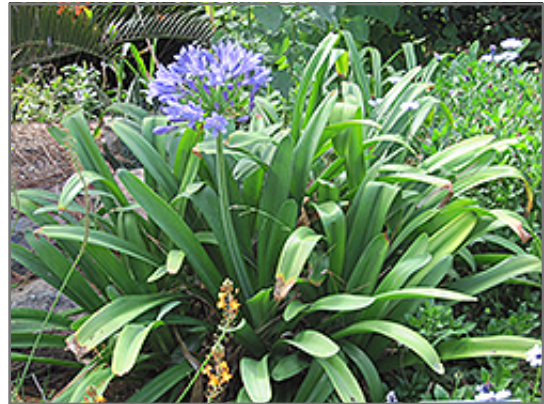
Queen Anne Agapanthus in bloom