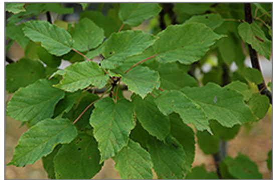
Pattern Perfect Tatarian Maple foliage