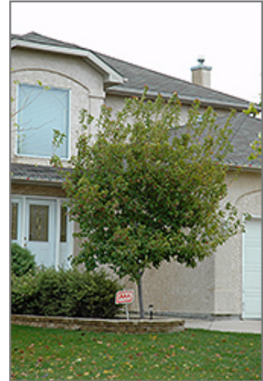
Pattern Perfect Tatarian Maple