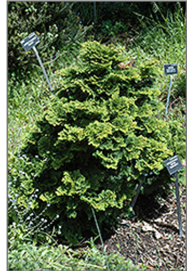
Tempelhof Falsecypress