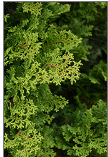
Tempelhof Falsecypress foliage