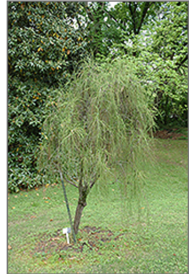
Threadleaf Arborvitae