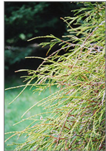
Threadleaf Arborvitae foliage