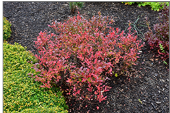
Lowbush Blueberry in fall