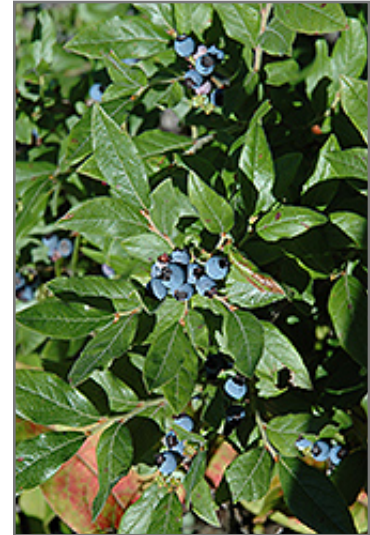
Lowbush Blueberry fruit

This is an open spreading deciduous shrub with a spreading, ground-hugging habit of growth. Its relatively fine texture sets it apart from other landscape plants with less refined foliage. This is a relatively low maintenance plant, and usually looks its best without pruning, although it will tolerate pruning. It is a good choice for attracting birds to your yard. It has no significant negative characteristics.