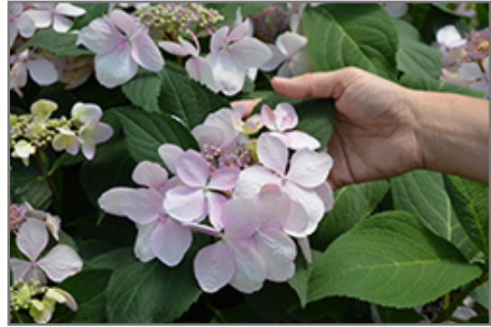
Let's Dance Diva! Hydrangea flowers

Let's Dance Diva! Hydrangea makes a fine choice for the outdoor landscape, but it is also well-suited for use in outdoor pots and containers. Because of its height, it is often used as a 'thriller' in the 'spiller-thriller-filler' container combination; plant it near the center of the pot, surrounded by smaller plants and those that spill over the edges. It is even sizeable enough that it can be grown alone in a suitable container. Note that when grown in a container, it may not perform exactly as indicated on the tag - this is to be expected. Also note that when growing plants in outdoor containers and baskets, they may require more frequent waterings than they would in the yard or garden.