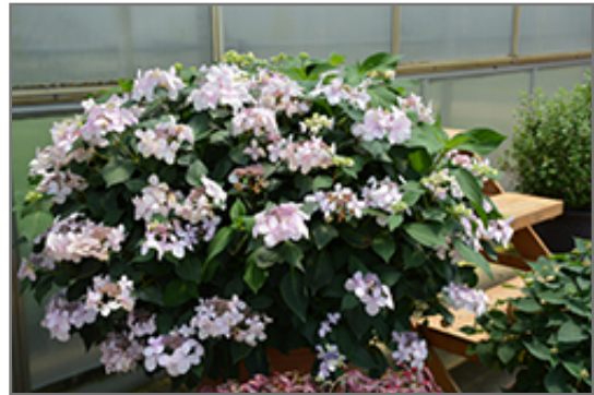
Let's Dance Diva! Hydrangea in bloom