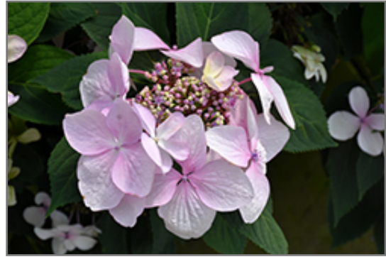
Let's Dance Diva! Hydrangea flowers

Let's Dance Diva! Hydrangea is recommended for the following landscape applications;