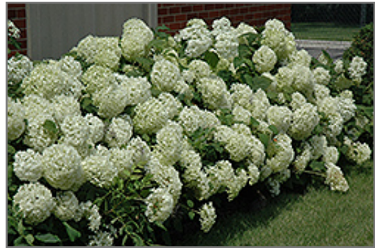
Annabelle Hydrangea in bloom