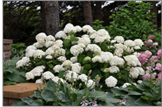
Annabelle Hydrangea in bloom