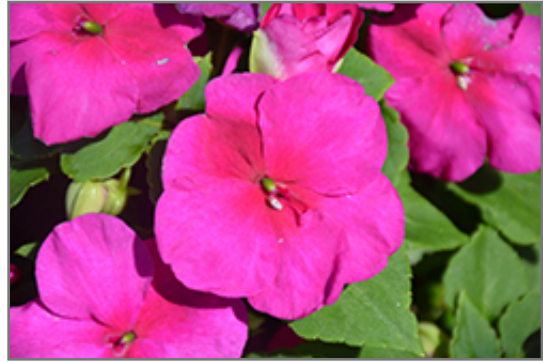
Super Elfin Ruby Impatiens in bloom