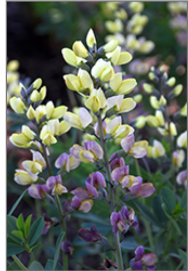
Decadence Deluxe Pink Lemonade False Indigo flowers

This is a relatively low maintenance plant, and is best cleaned up in early spring before it resumes active growth for the season. It is a good choice for attracting bees and butterflies to your yard. It has no significant negative characteristics.