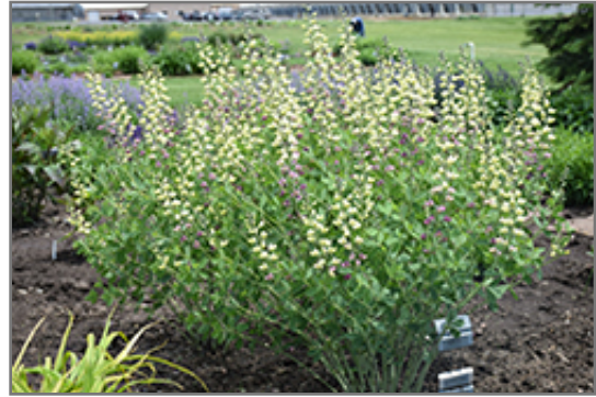
Decadence Deluxe Pink Lemonade False Indigo in bloom

Decadence Deluxe Pink Lemonade False Indigo will grow to be about 4 feet tall at maturity, with a spread of 4 feet. It tends to be leggy, with a typical clearance of 1 foot from the ground, and should be underplanted with lower-growing perennials. It grows at a slow rate, and under ideal conditions can be expected to live for approximately 25 years. As an herbaceous perennial, this plant will usually die back to the crown each winter, and will regrow from the base each spring. Be careful not to disturb the crown in late winter when it may not be readily seen!