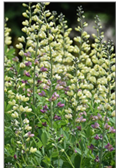
Decadence Deluxe Pink Lemonade False Indigo flowers