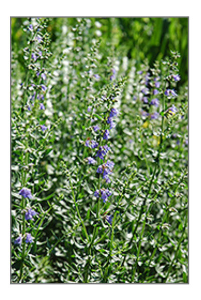
Hyssop flowers