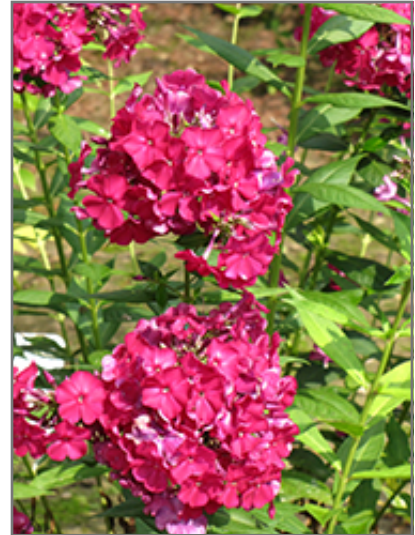
Nicky Garden Phlox flowers

Nicky Garden Phlox features bold fragrant conical hot pink star-shaped flowers at the ends of the stems from early summer to early fall. The flowers are excellent for cutting. Its narrow leaves remain green in color throughout the season.