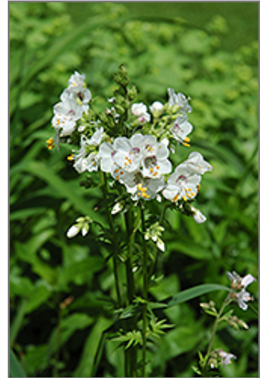
White Jacob's Ladder flowers