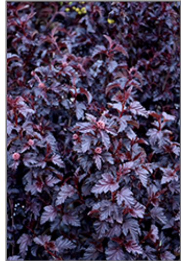
Panther Ninebark foliage