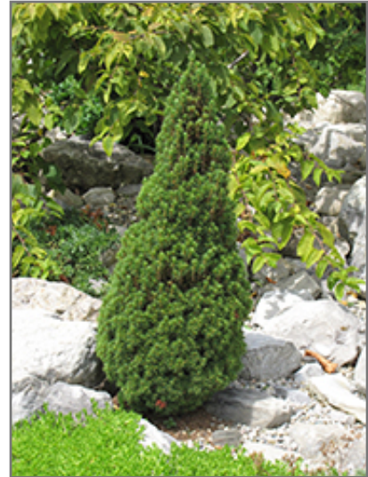
Jean's Dilly Spruce

Jean's Dilly Spruce will grow to be about 4 feet tall at maturity, with a spread of 24 inches. It tends to fill out right to the ground and therefore doesn't necessarily require facer plants in front. It grows at a slow rate, and under ideal conditions can be expected to live for 50 years or more.