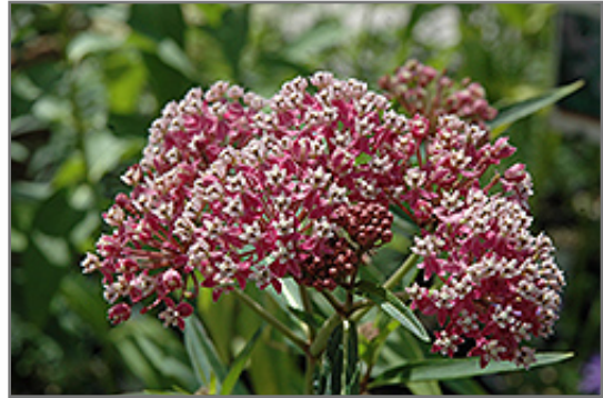
Cinderella Milkweed flowers

Cinderella Milkweed is recommended for the following landscape applications;