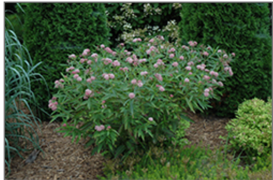
Cinderella Milkweed in bloom