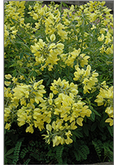
Yellow Wild Indigo flowers