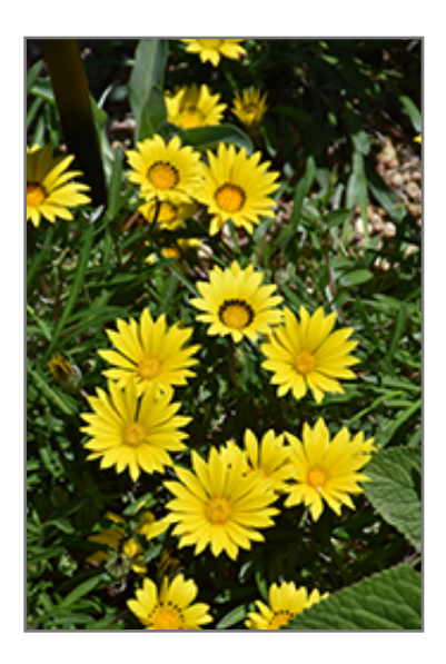
Colorado Gold Gazania flowers

Colorado Gold Gazania is recommended for the following landscape applications;