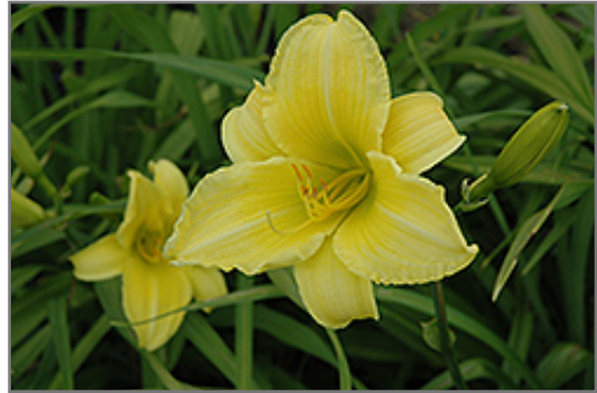
Eenie Weenie Daylily flowers