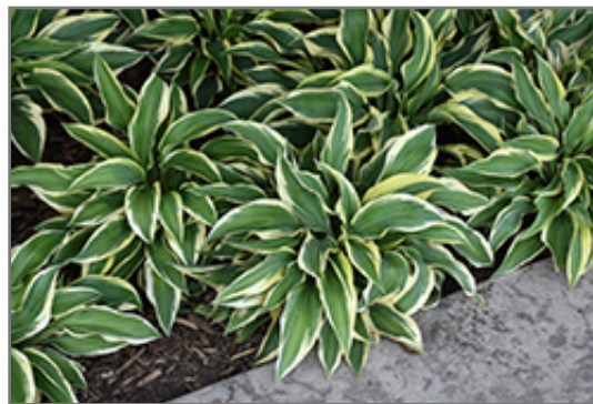
Wolverine Hosta