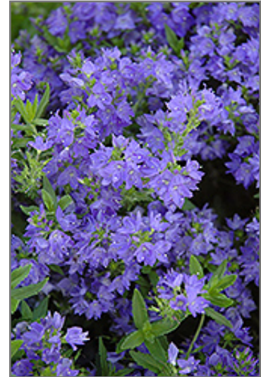
Trehane Creeping Speedwell flowers

Trehane Creeping Speedwell is recommended for the following landscape applications;