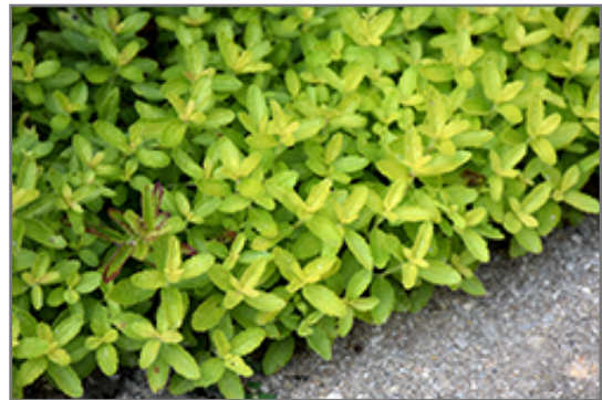
Trehane Creeping Speedwell