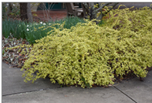
Twist of Lime Glossy Abelia

Twist of Lime Glossy Abelia is recommended for the following landscape applications;