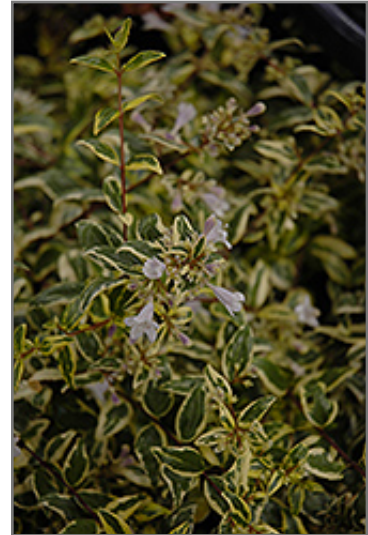
Twist of Lime Glossy Abelia flowers

Twist of Lime Glossy Abelia makes a fine choice for the outdoor landscape, but it is also well-suited for use in outdoor pots and containers. It can be used either as 'filler' or as a 'thriller' in the 'spiller-thriller-filler' container combination, depending on the height and form of the other plants used in the container planting. It is even sizeable enough that it can be grown alone in a suitable container. Note that when grown in a container, it may not perform exactly as indicated on the tag - this is to be expected. Also note that when growing plants in outdoor containers and baskets, they may require more frequent waterings than they would in the yard or garden.