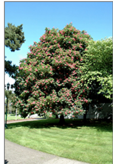
Ruby Red Horse Chestnut in bloom