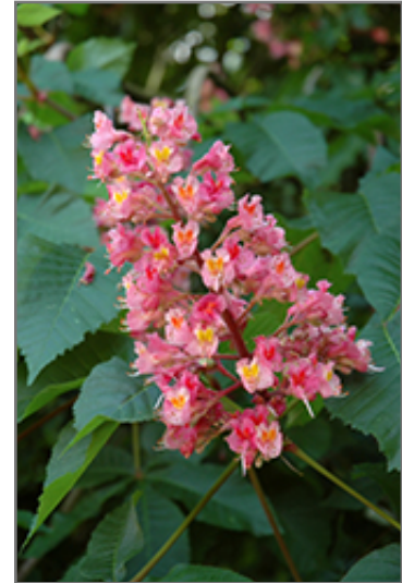
Ruby Red Horse Chestnut flowers