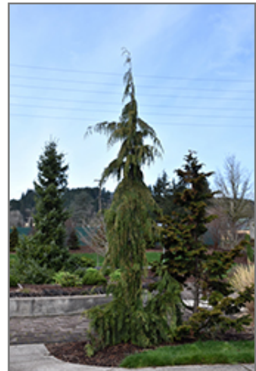
Weeping Nootka Cypress