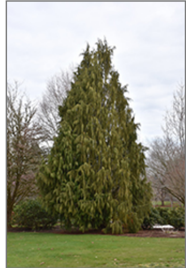
Weeping Nootka Cypress