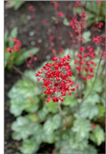
Lipstick Coral Bells flowers

Red bells rise from compact mounds of mint-green foliage with silver overlay; amazing contrast to other plants; great versatility; keep soil moist in heat of summer