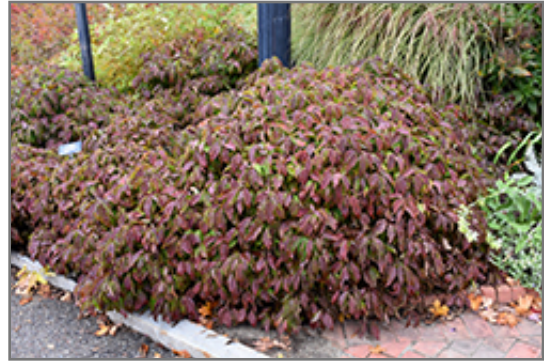
Kelsey Dogwood in fall

This shrub does best in full sun to partial shade. It is an amazingly adaptable plant, tolerating both dry conditions and even some standing water. It is not particular as to soil type or pH. It is highly tolerant of urban pollution and will even thrive in inner city environments. This is a selection of a native North American species.