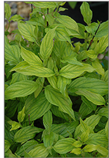
Kelsey Dogwood foliage