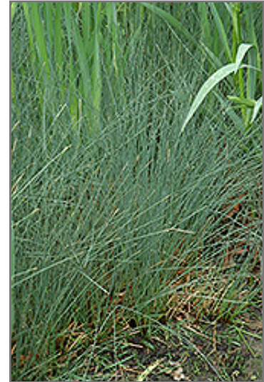
Soft Rush

Soft Rush will grow to be about 3 feet tall at maturity, with a spread of 12 inches. Its foliage tends to remain dense right to the ground, not requiring facer plants in front. It grows at a fast rate, and under ideal conditions can be expected to live for approximately 8 years. As an herbaceous perennial, this plant will usually die back to the crown each winter, and will regrow from the base each spring. Be careful not to disturb the crown in late winter when it may not be readily seen!