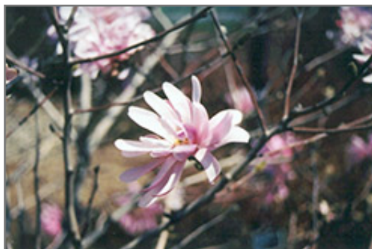
Pink Stardust Magnolia flowers