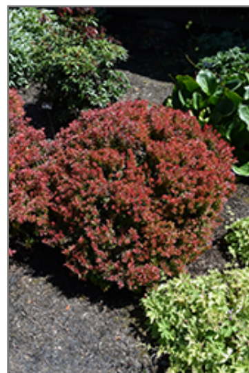
Golden Ruby Barberry