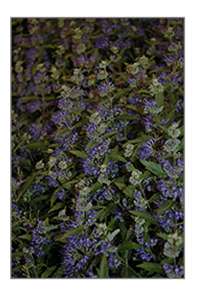
Blue Balloon Caryopteris flowers