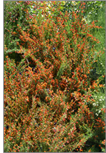
Lena Scotch Broom in bloom

This shrub should only be grown in full sunlight. It prefers dry to average moisture levels with very well-drained soil, and will often die in standing water. It is considered to be drought-tolerant, and thus makes an ideal choice for xeriscaping or the moisture-conserving landscape. It is particular about its soil conditions, with a strong preference for clay, alkaline soils, and is able to handle environmental salt. It is highly tolerant of urban pollution and will even thrive in inner city environments. This particular variety is an interspecific hybrid.