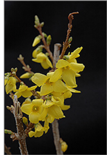
Show Off Forsythia flowers

Show Off Forsythia makes a fine choice for the outdoor landscape, but it is also well-suited for use in outdoor pots and containers. With its upright habit of growth, it is best suited for use as a 'thriller' in the 'spiller-thriller-filler' container combination; plant it near the center of the pot, surrounded by smaller plants and those that spill over the edges. It is even sizeable enough that it can be grown alone in a suitable container. Note that when grown in a container, it may not perform exactly as indicated on the tag - this is to be expected. Also note that when growing plants in outdoor containers and baskets, they may require more frequent waterings than they would in the yard or garden.