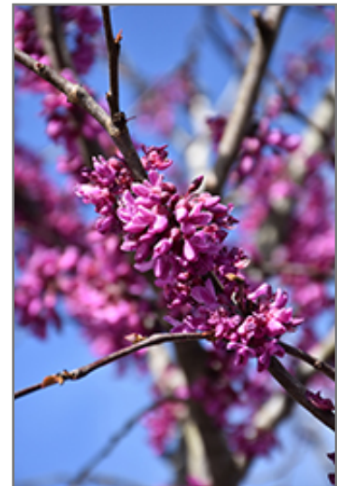
Eastern Redbud (tree form) flowers