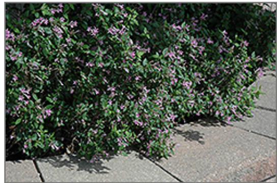
Leptodermis in bloom