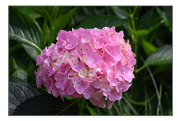
Let's Dance Moonlight Hydrangea flowers