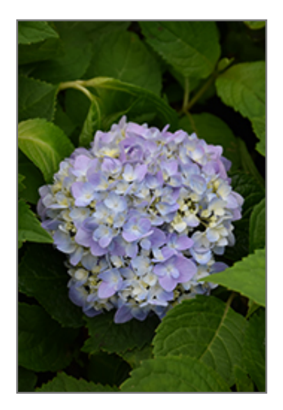
Let's Dance Moonlight Hydrangea flowers

Columbus Garden Center - 1156 Oakland Park Avenue, Columbus, OH 43224-3317 Phone: 614-268-3511 Fax: 614-784-7700 Delaware Garden Center - 25 Kilbourne Road, Delaware, OH 43015 Phone: 740-548-6633 Fax: 740-363-2091 Dublin Garden Center - 4261 West Dublin-Granville Road, Dublin, Ohio 43017 Phone: 614-874-2400 Fax: 614-874-2420 New Albany Garden Center - 5211 Johnstown Rd, New Albany, Ohio 43054 Phone: 614-917-1020 Fax: 614-917-1023