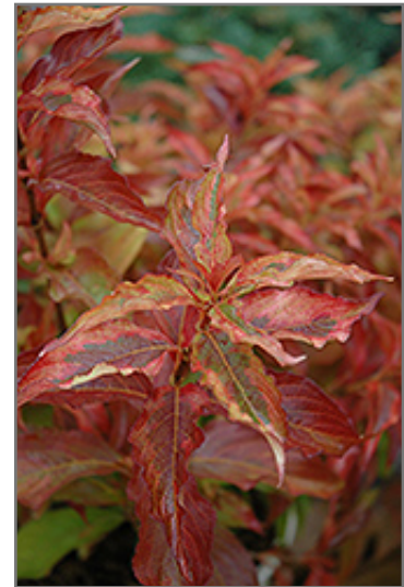
My Monet Sunset Weigela foliage

My Monet Sunset Weigela makes a fine choice for the outdoor landscape, but it is also well-suited for use in outdoor pots and containers. It is often used as a 'filler' in the 'spiller-thriller-filler' container combination, providing a mass of flowers and foliage against which the thriller plants stand out. Note that when grown in a container, it may not perform exactly as indicated on the tag - this is to be expected. Also note that when growing plants in outdoor containers and baskets, they may require more frequent waterings than they would in the yard or garden.