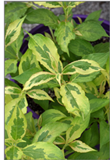
My Monet Sunset Weigela foliage

My Monet Sunset Weigela is recommended for the following landscape applications;