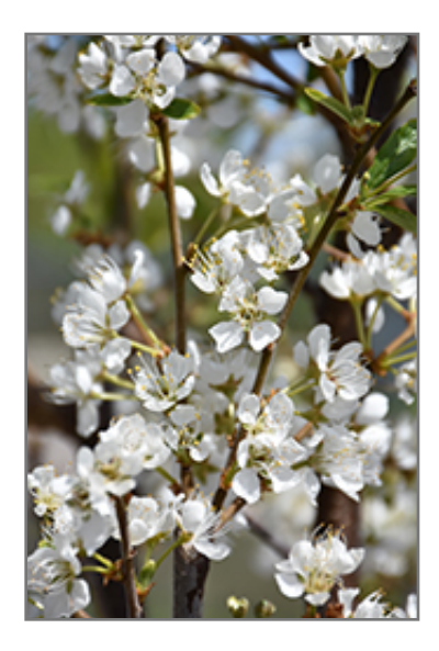
Toka Plum flowers