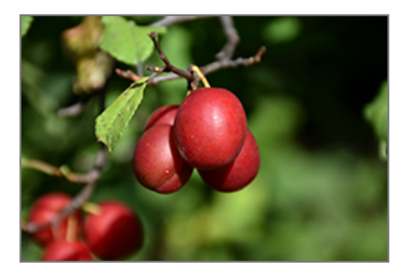
Toka Plum fruit