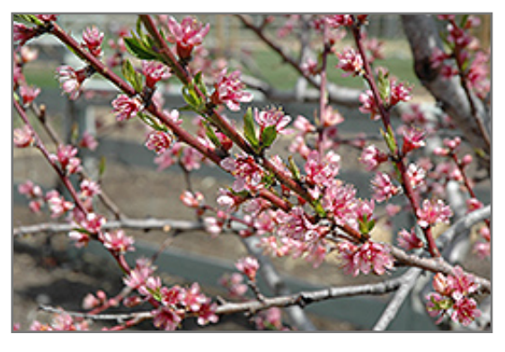
Redhaven Peach flowers