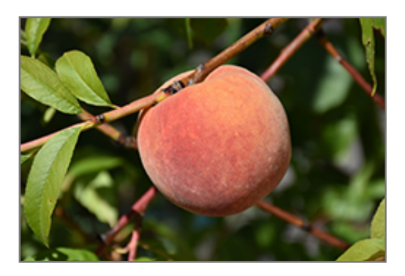
Redhaven Peach fruit