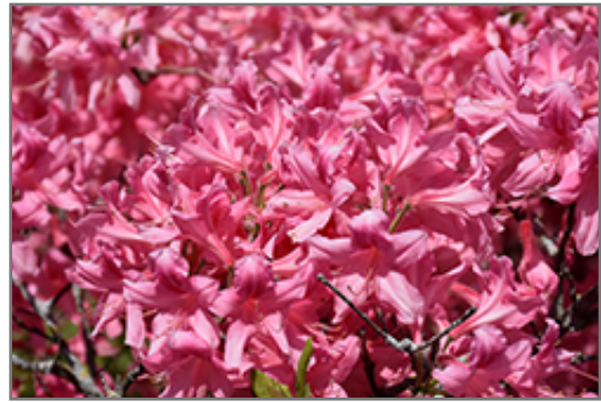
Rosy Lights Azalea flowers

Rosy Lights Azalea is recommended for the following landscape applications;