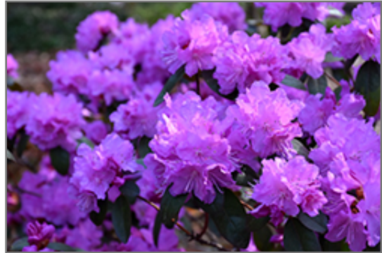
P.J.M. Elite Rhododendron flowers

P.J.M. Elite Rhododendron is recommended for the following landscape applications;