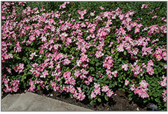
Nearly Wild Rose in bloom

Columbus Garden Center - 1156 Oakland Park Avenue, Columbus, OH 43224-3317 Phone: 614-268-3511 Fax: 614-784-7700 Delaware Garden Center - 25 Kilbourne Road, Delaware, OH 43015 Phone: 740-548-6633 Fax: 740-363-2091 Dublin Garden Center - 4261 West Dublin-Granville Road, Dublin, Ohio 43017 Phone: 614-874-2400 Fax: 614-874-2420 New Albany Garden Center - 5211 Johnstown Rd, New Albany, Ohio 43054 Phone: 614-917-1020 Fax: 614-917-1023