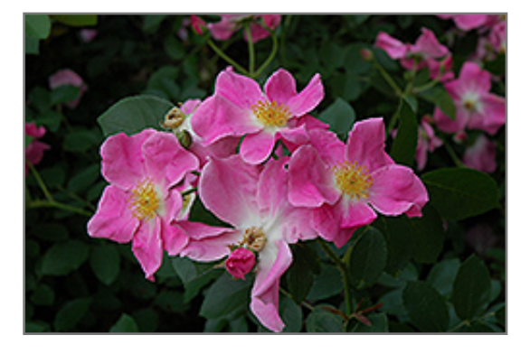
Nearly Wild Rose flowers

Nearly Wild Rose is recommended for the following landscape applications;