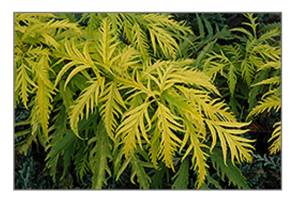
Sutherland Gold Elder foliage

Sutherland Gold Elder is recommended for the following landscape applications;