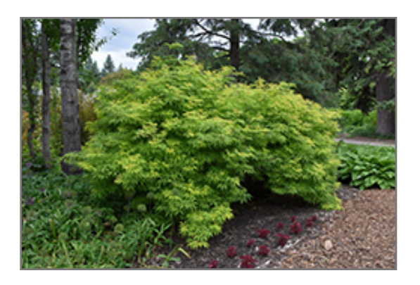
Sutherland Gold Flder

Columbus Garden Center - 1156 Oakland Park Avenue, Columbus, OH 43224-3317 Phone: 614-268-3511 Fax: 614-784-7700 Delaware Garden Center - 25 Kilbourne Road, Delaware, OH 43015 Phone: 740-548-6633 Fax: 740-363-2091 Dublin Garden Center - 4261 West Dublin-Granville Road, Dublin, Ohio 43017 Phone: 614-874-2400 Fax: 614-874-2420 New Albany Garden Center - 5211 Johnstown Rd, New Albany, Ohio 43054 Phone: 614-917-1020 Fax: 614-917-1023